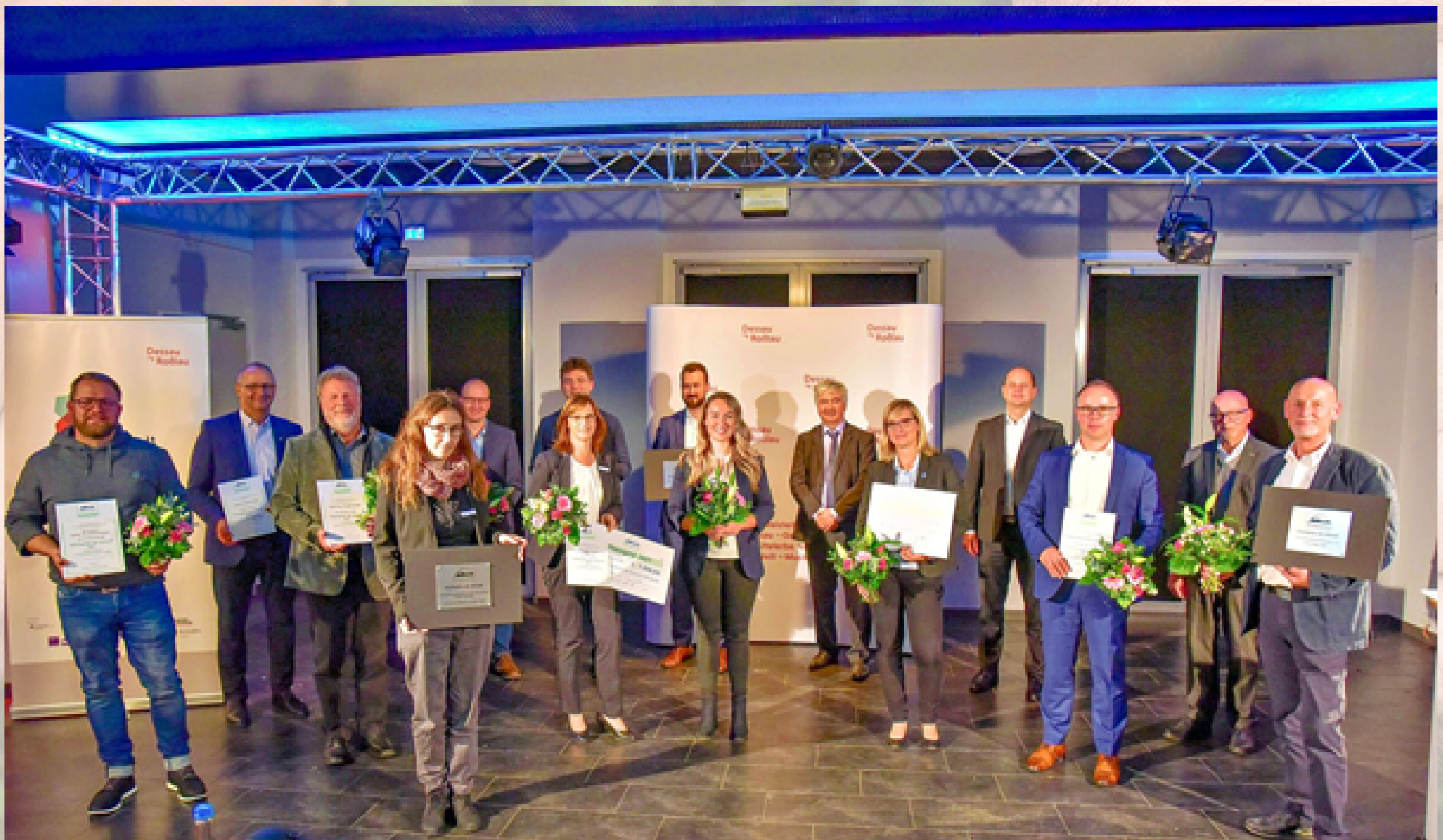
All the award winners and honorees with the laudators

An annual highlight of the activities is the presentation of the "Employer of the Future" award, which recognizes particularly good practice for the compatibility of work and family.